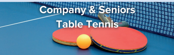
Table Tennis Singles Championships for Company (P7-S2) and Seniors (S3-S6) on Monday 27th January, 7pm at 44th Glasgow BB Halls, Dundee Drive. Entries by Monday 20th January.